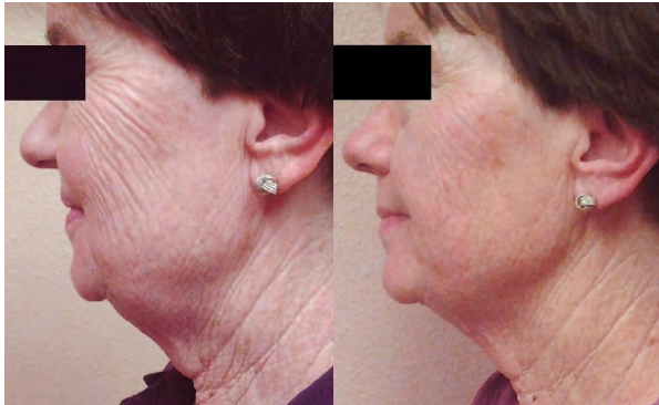
Four UltraSlim® Treatments

Better and safer results than injectables like Kybella® or Botox®.