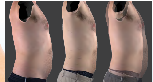
Christopher lost 27 pounds and 6.1 liters of belly fat with twelve 32-minute UltraSlim® treatments. Ask your doctor today for more information!